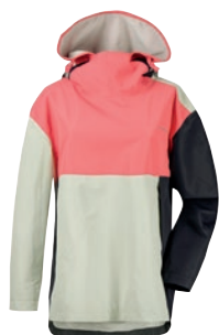
Tora Women's Jacket