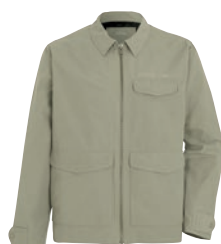
Valdemar Men's Jacket

Visit didriksons.com to explore the current collection and follow @didriksons for news and inspiration.