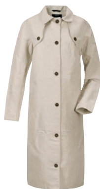
Leone Women's Coat