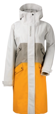
Estrid Women's Jacket 2