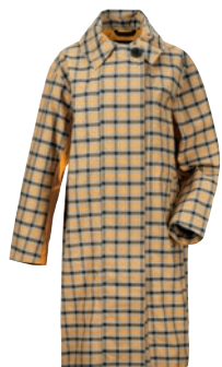
Embla Checked Women's Coat

Looking back, we have always been in step with the times. 108 years ago, we kept families together by protecting fishermen from the cold, harsh conditions at sea. Times have changed, and today we are faced with new challenges. We are forced to do things differently. It reminds us that our belief in the value of being outside is stronger than ever before. In these times we are the jacket brand that, when possible, lets people come together outside, enjoy the fresh air, feel great and good-looking, and stay out longer. This is what the Spring/Summer 2021 collection is all about. During the spring of 2021, we will celebrate a life outdoors in great company. And you are all invited, see you outside.