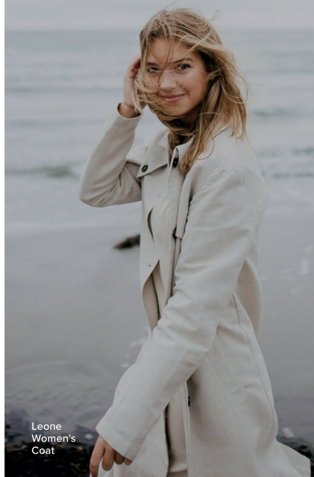
Leone Women's Coat